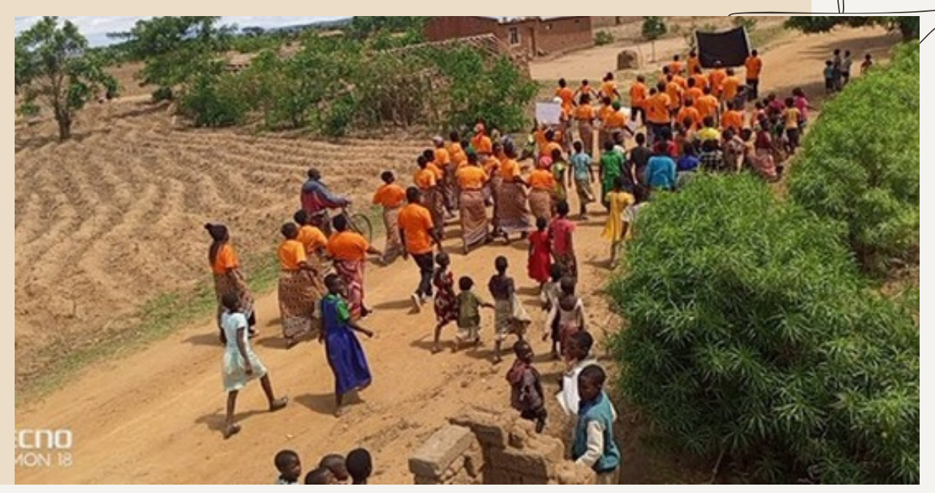
THE GENDER BASED VIOLENCE MARCH IN THE KANCHEDZERA COMMUNITY, MALAWI

IN DECEMBER, ABUNDANT LIFE MINISTRIES MALAWI WITH WHOM WE WORK IN MALAWI TOOK WHAT THEY HAVE LEARNED THROUGH OUR TRAINING PROGRAMS AND MARCHED THROUGH THEIR COMMUNITIES, IN ORDER TO BRING ATTENTION TO GENDER BASED VIOLENCE. THIS WAS THE FIRST TIME ANY OF THE COMMMUNITIES HAD EXPERIENCED A MARCH. ABUNDANT LIFE MINISTRIES MALAWI, WE ARE VERY VERY PROUD OF YOU AND OUR MALAWIAN FRIENDS